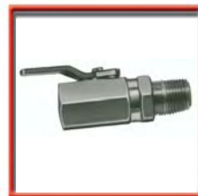
Flow Regulating Valve