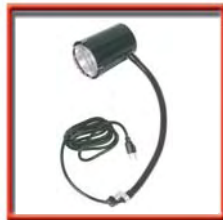
Deluxe Work Lamp