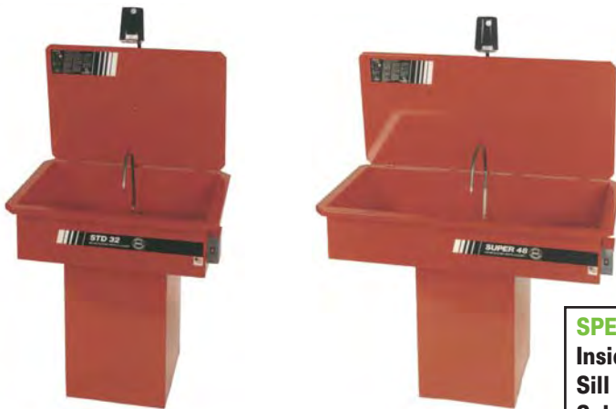
Base Mounted Deluxe Parts Washer Catalog No. STD32 & SUP48