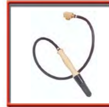
Flow Thru Brush Assembly